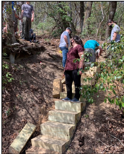
Eagle Scout project steps at Sassafra.