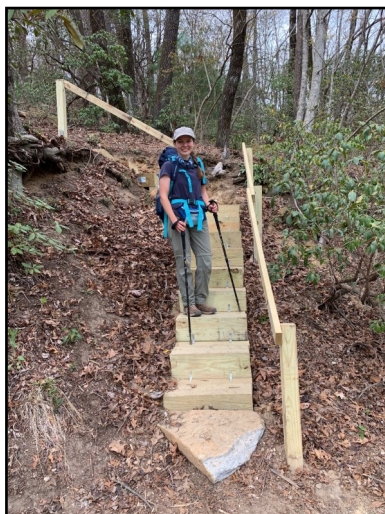
A backpacker tests out the new steps installed near Sassafras.