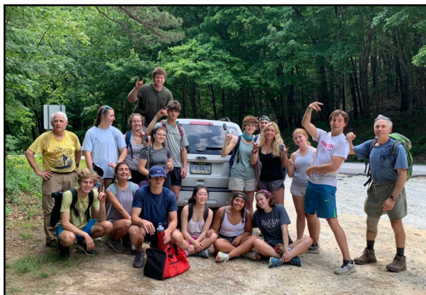
A group from the Baylor School, who sends students each year to help work on, and enjoy, the Foothills Trail.